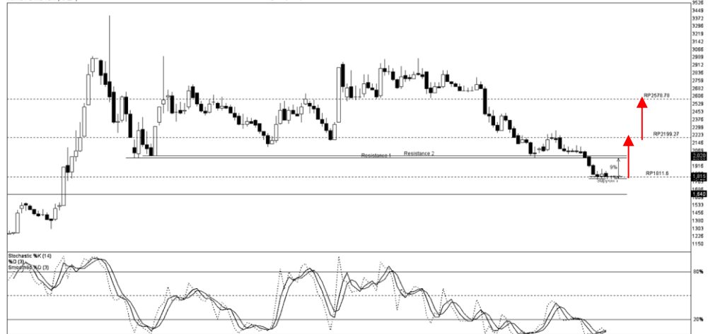
Kinerja saham KAEF

Kimia Farma Tbk (KAEF) 24020217 O:1850 H:1970 L:1800 C:1815 V:1.82M Chg:-25 (-1.4%)